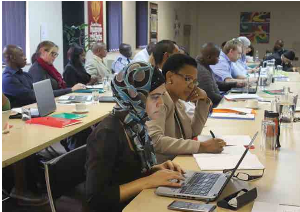
Participants at the Dialogue

Police are, however, vulnerable themselves. Trauma in the police is severe and suicide figures are very high. There are too few police psychologists. Whenever a police officer has been involved in a fatal shooting, that member should not be allowed to carry a firearm until such time as a psychiatrist gives permission. There should be debriefing after any POP operation because police members are often aggressive at that point. During the Lwandle Commission of Inquiry into the evictions of hundreds of people, it emerged that police who were engaged in the evictions were not debriefed after the first day of events, and the lack of debriefing could have contributed to police violence against those people on the second day.